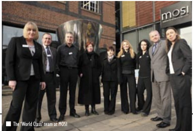
■ The 'World Class' team at MOSI

So go and see for yourself - for events and activities visit www.msim.org.uk